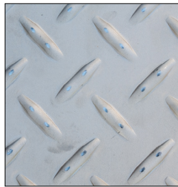
Pressed (Available on Indent)