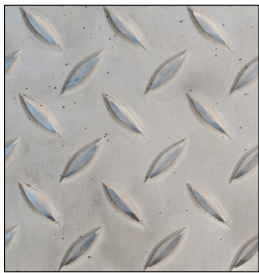
HRAP Pattern B